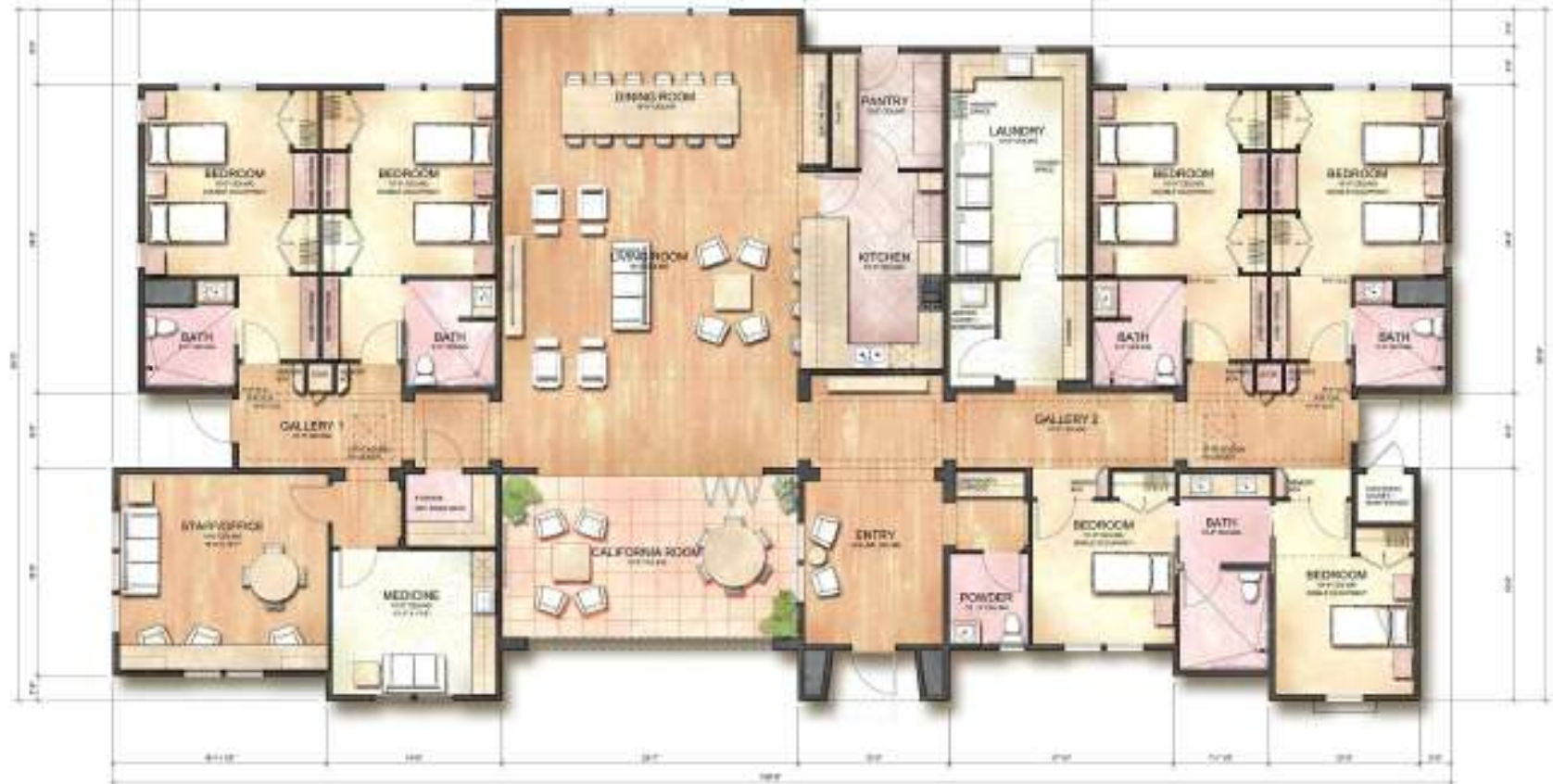
1 TYPICAL RESIDENCE 5 & 6 FLOOR PLAN 4,644 SQ. FT. CONDITIONED / 331 SQ. FT. CALIFORNIA ROOM